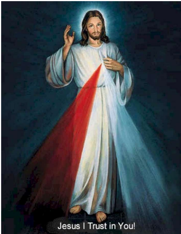
Jesus | Trust in You!

All most cordially welcome St Plunkett Church: (03) 9354-1564 Divine Mercy Apostolate: (03) 9354 3878